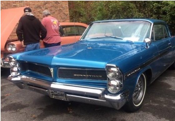
Pontiac Bonneville and Edsel at Nottingham UMC Car Show