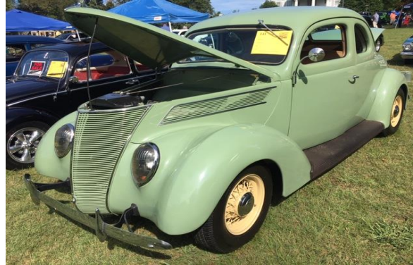
1930s Ford at Allandale