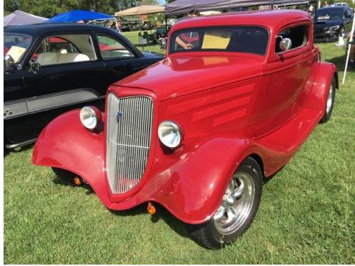
1934 Ford at Allandale