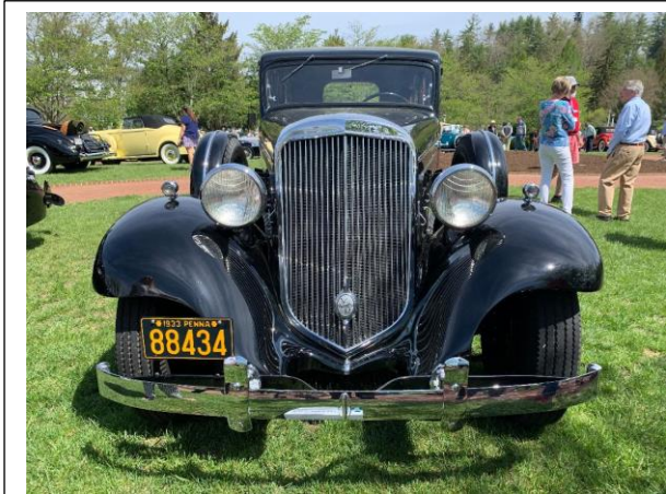
Front view of Franklin 12 cylinder at Greenbrier