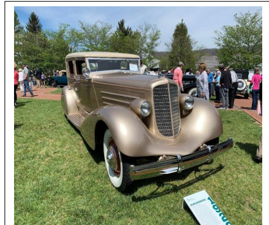
Duesenberg at Greenbrier