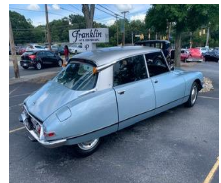
Citroen DS in Mooresville, NC