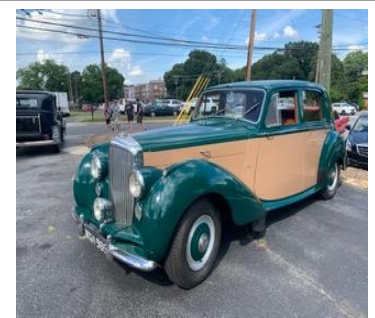
Bentley in Mooresville, NC