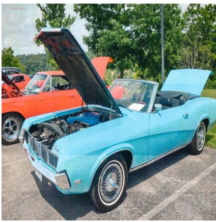
1969 Mercury Cougar at Laurels Car Show