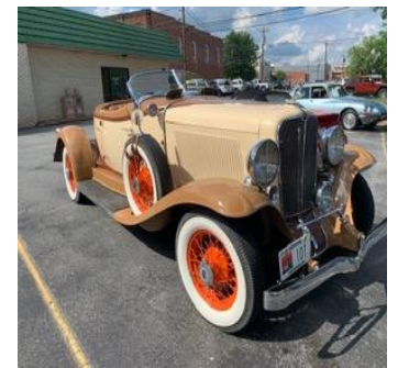
Boat Tail Auburn Speedster in Mooresville, NC