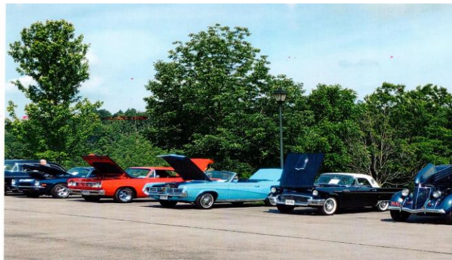
Cars at The Laurels Car Show in June