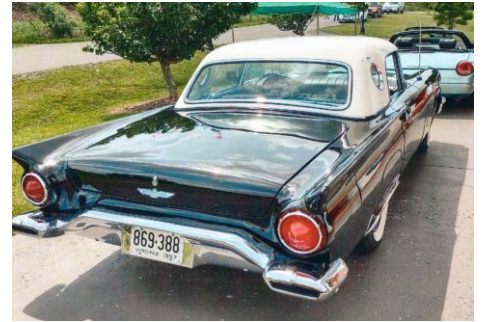
1957 Ford Thunderbird at Laurels Car Show