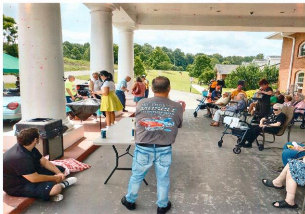
Residents at The Laurels watching the Show