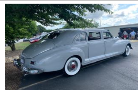
1947 Packard in Mooresville, NC