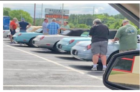
Big Serjents Kaiser Manhattan