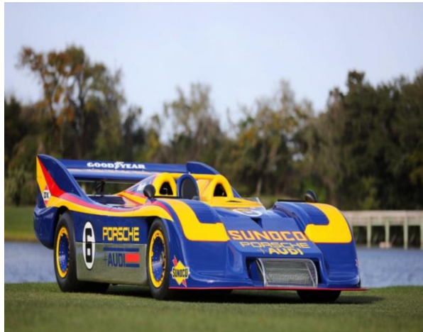
Porsche 917/30 Can-Am