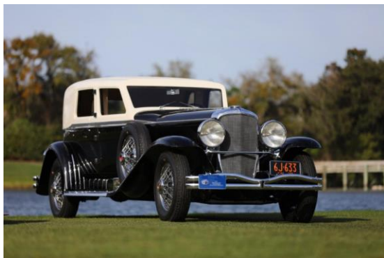
1929 Duesenberg Limousine at Amelia Island