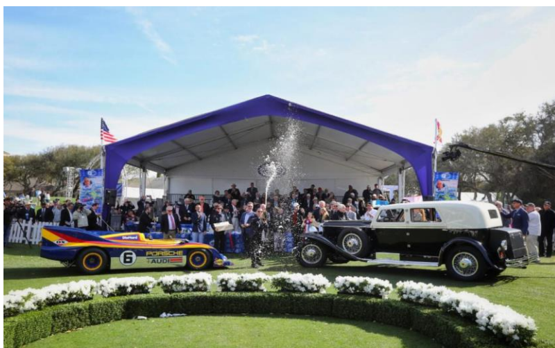
The Two "Best of Show" Cars from the Amelia Island Concours