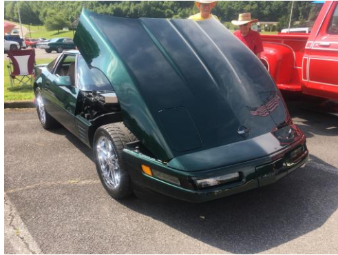
Jim Woodard's Corvette