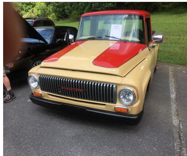
International Pick up at FunFest

Limited edition Jim Caswell Allandale 2019 T-shirts are available. Slightly less than 100 remain. Sizes S-XL- $12, 2XL-3XL - $15. You may purchase yours at the Dan'l Boone Car Club picnic on Monday, August 19th or at our monthly Sonic Cruise in on Friday, August 23rd.