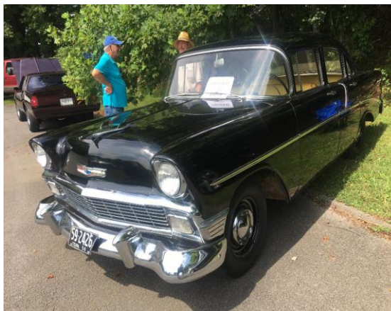
Mike McIntosh's 1956 Chevrolet with 9500 miles showing