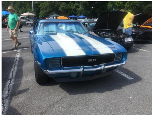
Sergio's Camaro RS