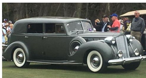
This Packard has a removable top; however it weighs 600 pounds and rolled into the lake at Hilton Head last year.