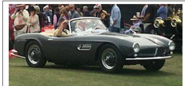
1950 6 BMW sports car