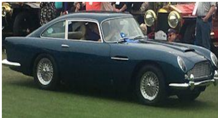
Aston Martin DB5-this was the type of car used in the early James Bond Movies