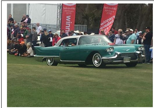
1957 Eldorado Seville Cadillac