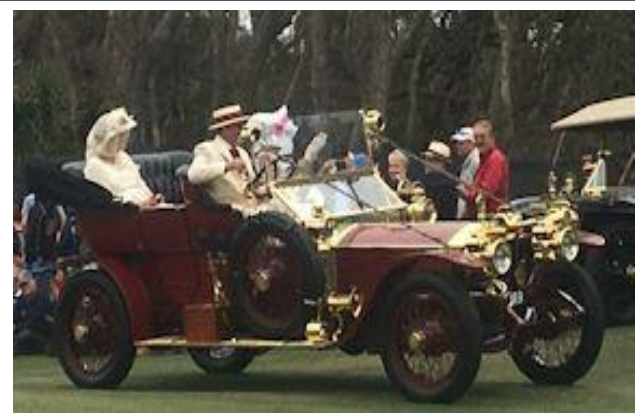
Family in costume in their Rolls Royce Silver Ghost