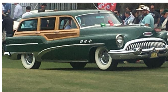
A Buick Estate Wagon