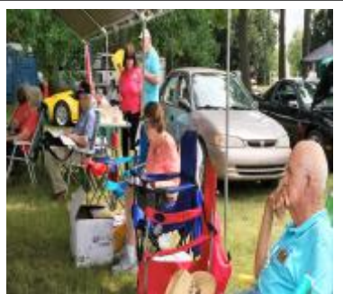
Hope to see you there in 2016