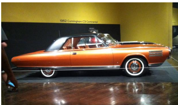
1952 Cunningham C3 Continental