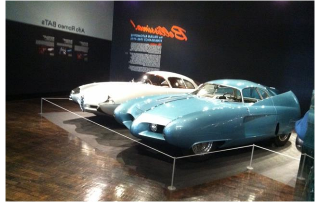
Bellissima Italian Car Design Exhibit at Frist Museum