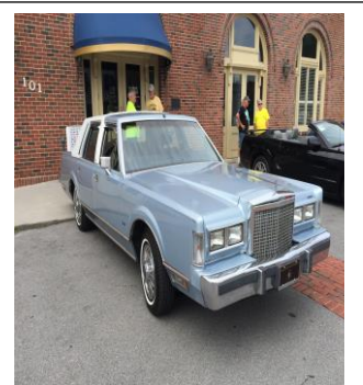
Woody Fleenor's 1987 Lincoln Towncar