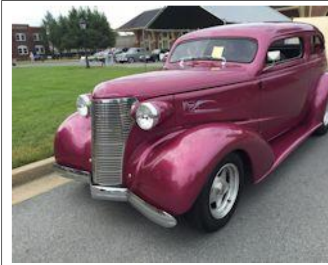
Les Lawson's 1938 Chevrolet