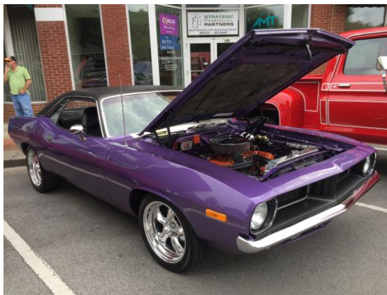
Plum Crazy Cuda