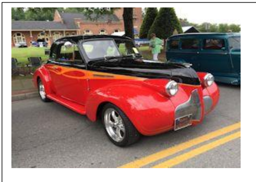
Handsome Street Rod