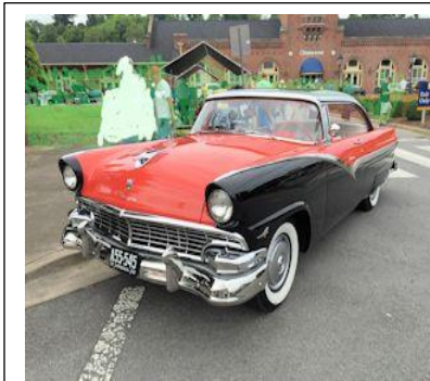
Mid Fifties Crown Victoria