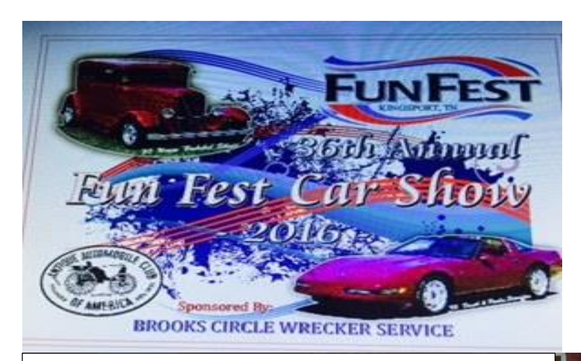
Dash Plaque given to participants at the Fun Fest Car Show