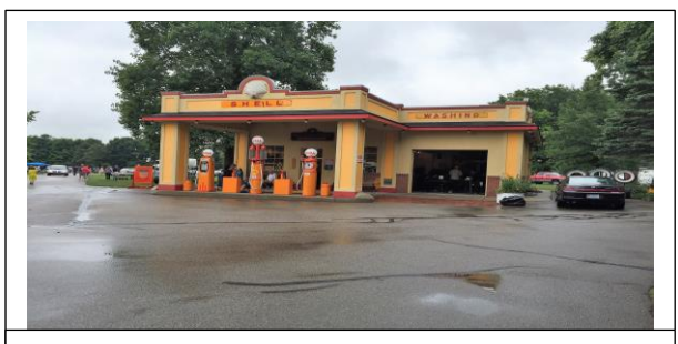
Vintage Service Station-Gilmore Museum, MI