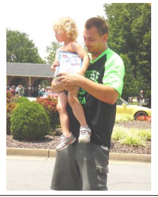
One of the happy winners at the Fun Fest car Show.