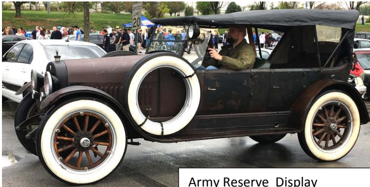
Army Reserve Display