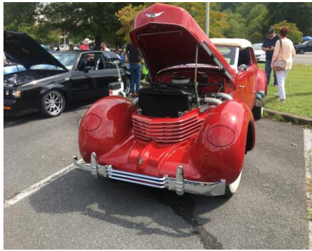
Pal Barger's 1936 Cord Convertible at the Allandale Show