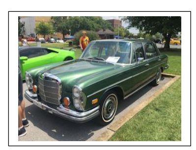
*Randy Still's Mercedes Benz 280 SEL