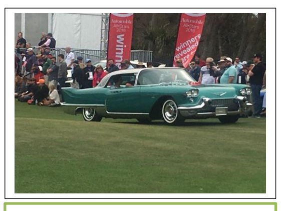
1957 Eldorado Seville Cadillac