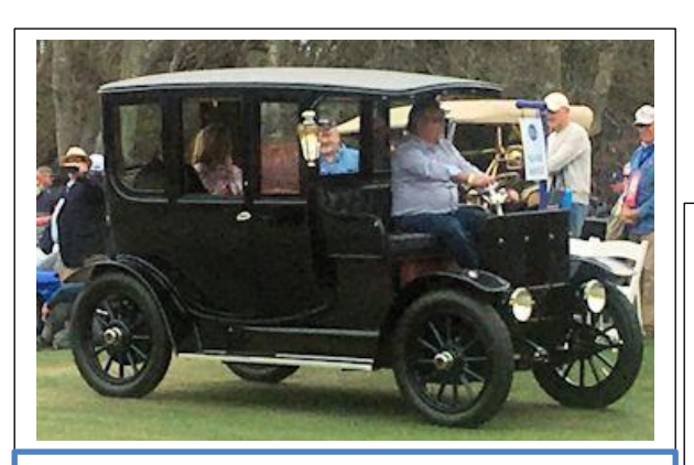
RauschA and Lang shown at electric car show- an earlier version of the car owned by Carol Redmond.