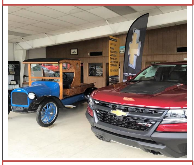
What a difference a hundred years can make!