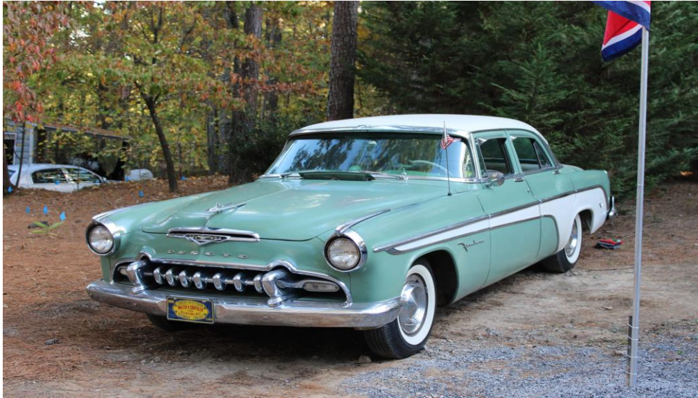
Another beautiful Chrysler from Fred Counts' Presentation

Remember to Pay your local dues $15 for a single and $20 for a Couple