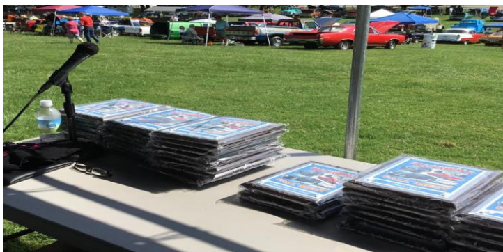
Allandale Award Plaques