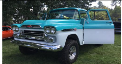
Chevrolet 4wd Pickup