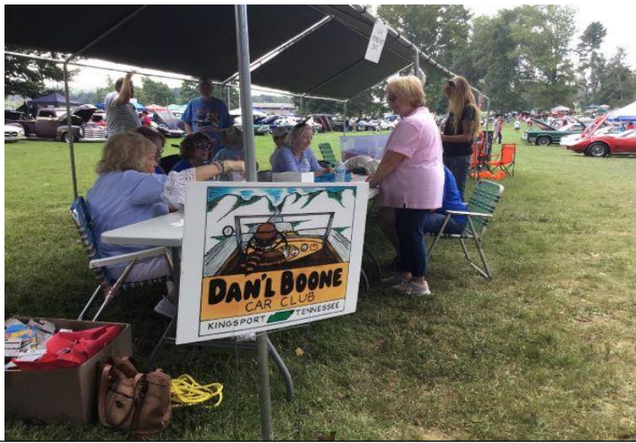
Afternoon Allandale 2022 Registration Tent