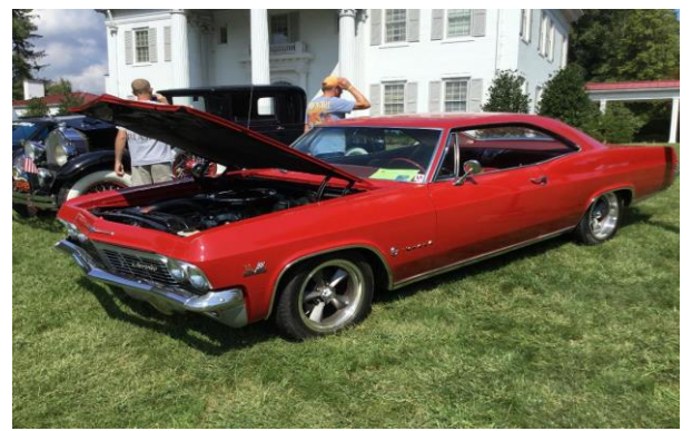
1965 Chevrolet Impala