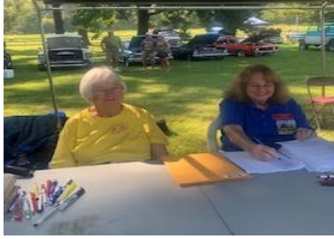
Early Morning Registration