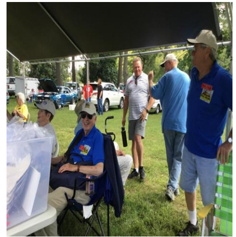
Selling T-shirts, still have T-shirts for sale at the next meeting