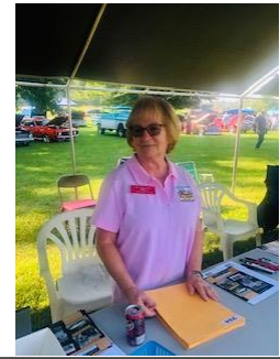
Early Morning Registration