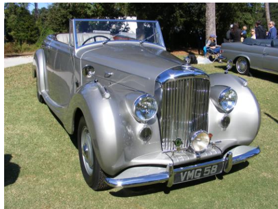
Bentley Convertible at Hilton Head Concours