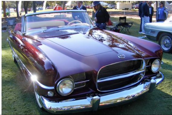
1958 Dual Ghia Convertible at Hilton Head Concours