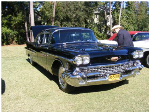
1958 Cadillac Fleetwood 75 Limousine at Hilton Head Concours