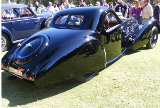
Rear view of 1937 Bugatti Type 57S at Hilton Head Concours