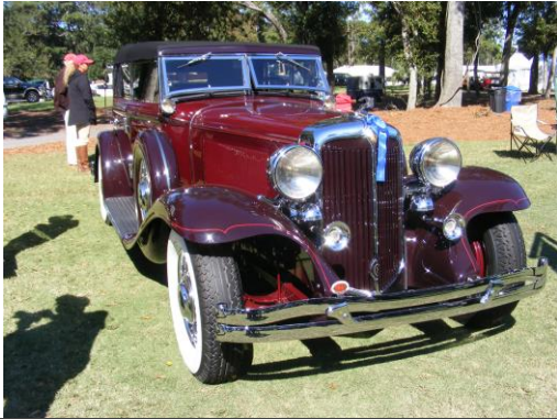
1932 Chrysler Imperial at Hilton Head Concours