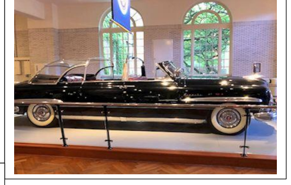
Presidential Cars located in the Henry Ford Museum. Due to limited time I wasn't able to photograph all that were available.