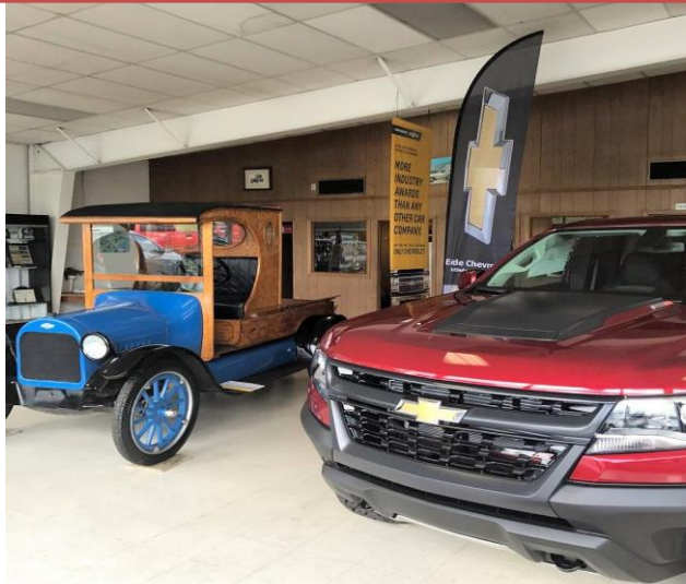
What a difference a hundred years can make!