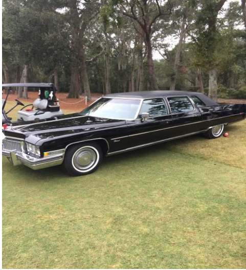
1973 Cadillac Fleetwood 75 Limo used by Pat Nixon