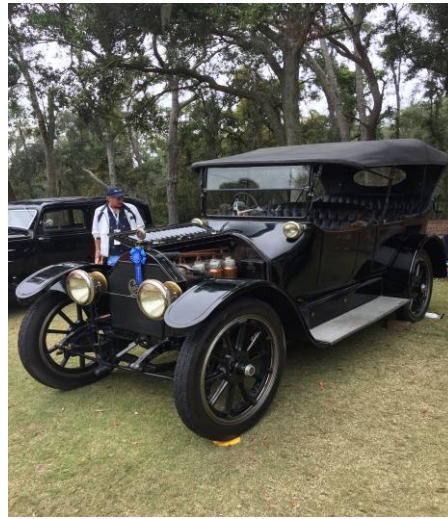
1916 Cadillac at Hilton Head Concours