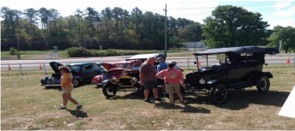
A couple of Model T's