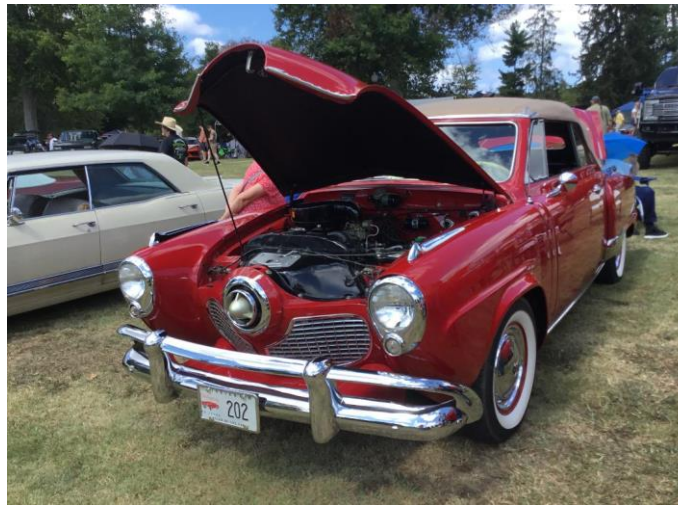
Beatrice & Alan Dias' Studebaker Convertible